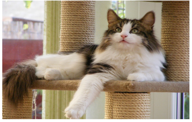
Fern - my very first queens