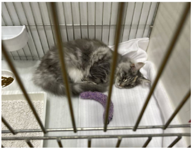
Zelandonii Lovely-Rita at the Surrey & Sussex 2022

When you return to the hall after 1pm, you can go and see your cat and give them some food and cuddles. The judges will still be working in the afternoon so if they come to your pen while you are there, you'll need to move away until they're finished.